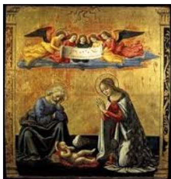
Domenico Ghirlandaio The Nativity, c. 1492

O come, desire of nations, bind in one the hearts of humankind; bid ev'ry sad division cease and be thyself our Prince of peace. Rejoice! Rejoice! Emmanuel shall come to thee, O Israel.