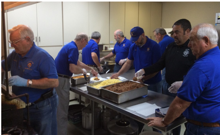
Brother Knights working together on the burrito "assembly line" made 20 dozen burritos this month — an all-time high!