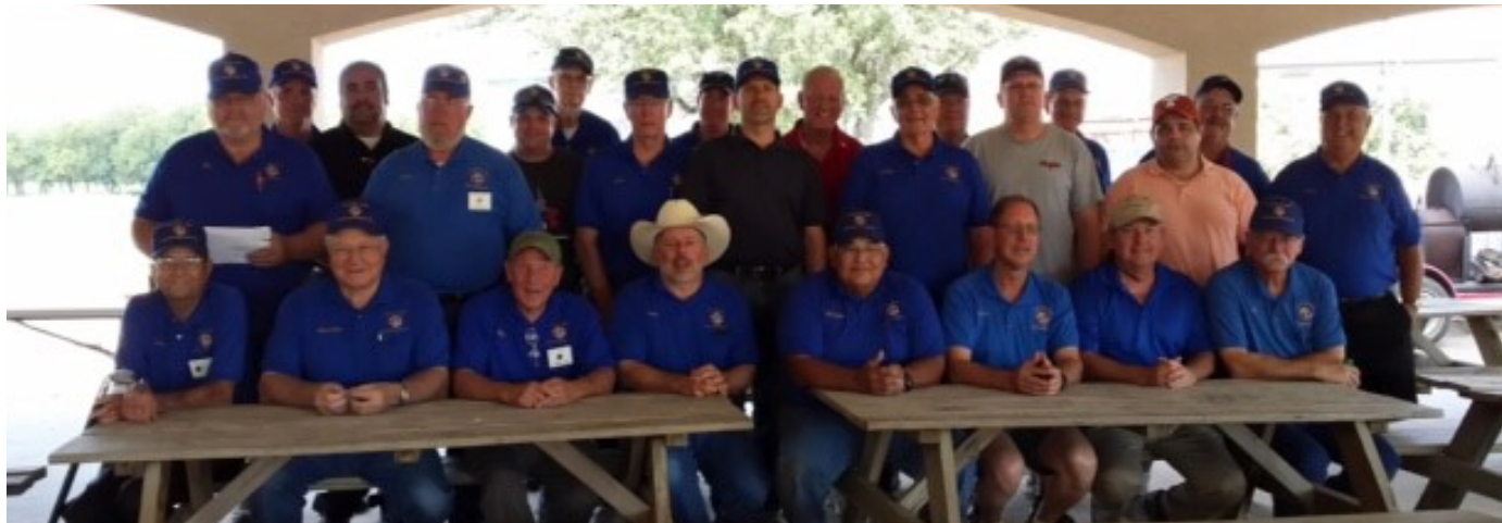
Brother Knights from Holy Spirit Council 7264 take a short break to pose for a group photo before serving lunch to over 170 golfers, volunteers, and club employees during the annual Golf Tournament at Split Rail Links & Golf Club in Annetta, Texas