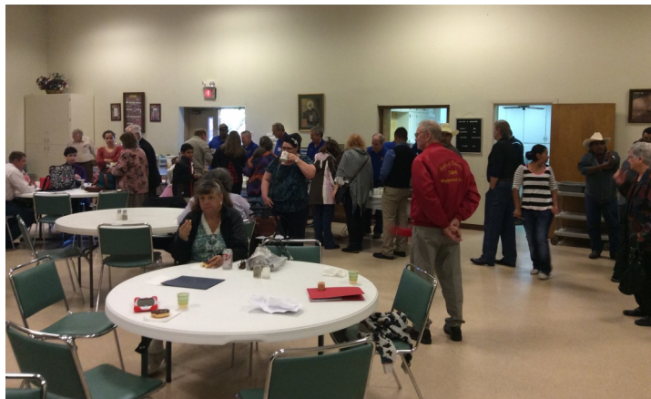
St Stephen parishioners enjoy a delicious breakfast after mass.